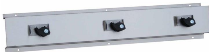
*ML981_3 image shown