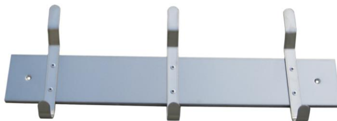
*ML980_3 image shown